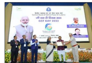
CBIC honoured 50,000 taxpayers and officers who contributed to the GST success story.

The country commemorated Sixth Goods and Services Tax (GST) Day on July 1 to honour the successful implementation of the GST regime. It was celebrated with the vision GST@6 सरलीकृत कर, समग्र विकास with Ms. Nirmala Sitharaman, Hon. Union Minister for Finance & Corporate Affairs, presiding over as the Chief Guest and Sh. Pankaj Chaudhary, Hon. Union Minister of State for Finance, as the Guest of Honour. Senior officials from Ministry of Finance, Central Board of Indirect Taxes and Customs (CBIC) & Central Board of Direct Taxes (CBDT) and other government departments were present. Minister Nirmala Sitharaman, while addressing the function, said, “GST is the embroidery that stitches the diversity