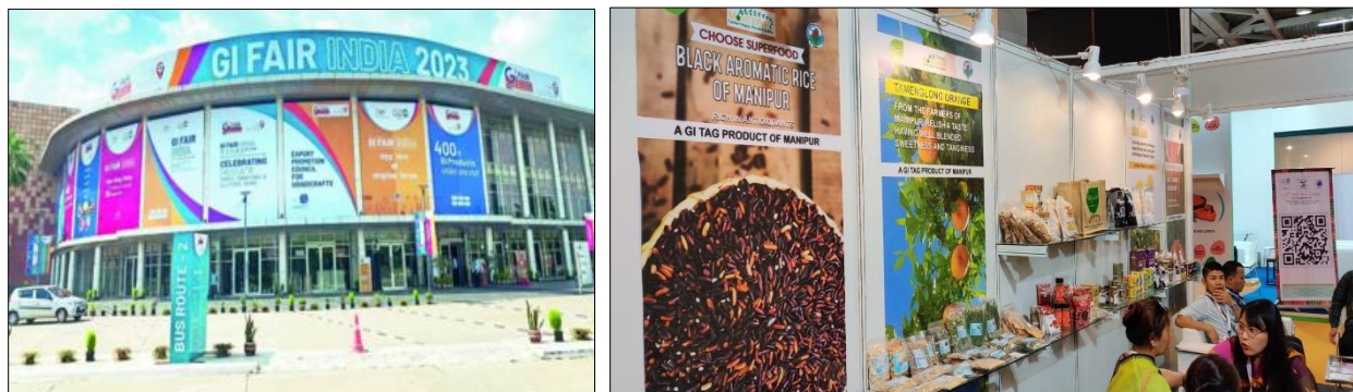
The second edition of the Geographical Indication (GI) Fair in Greater Noida proved to be a captivating experience and a shopper's delight, drawing hundreds of visitors. It showcased an array of GI products and featured artists & producers from all corners of India.

India's 440 GI-tagged products (Geographical Indication) were exhibited at the second edition of the GI Fair India in Greater Noida. GI tag is given to products having distinct qualities and tradition linked to their place of origin. The fair also featured Blue Pottery, Sanganeri hand block printing and Bikaneri bhujia of Rajasthan; Gulabi Meenakari, Banaras brocade and Lucknow Chikan craft from Uttar Pradesh to tezpat, aipan art and Munsyari razma from Uttarakhand, Kangra tea, Chamba Rumal and Kullu Shawls from Himachal Pradesh to Allepy green cardamom, Vedic era mirror and navara rice from Kerala among others.