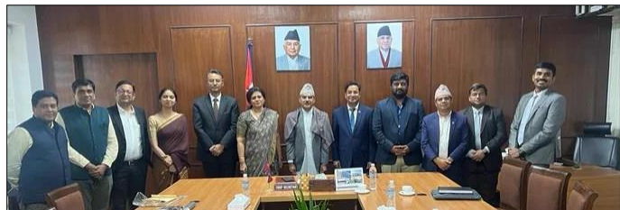
Ms. Sumita Dawra, Special Secretary, DPIIT, led a delegation to Nepal to brief the Govt. of Nepal on the benefits of infrastructure planning using #PMGatiShakti National Master Plan for multimodal connectivity.

Ms. Sumita Dawra, Special Secretary, Department for Promotion of Industry and Internal Trade, Ministry of Commerce & Industry, Government of India, led a delegation to Nepal on July 21, 2023, to brief the Govt. of Nepal on the benefits of infrastructure planning using PM Gati Shakti National Master Plan for multimodal connectivity. The visit flows from the high-level discussions held during the Nepal Prime Minister's visit to