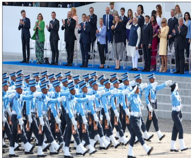
Hon. PM Modi and President Macron saw the Bastille Day military parade at the Champs-Élysées in Paris. On this special occasion, a tri-service Indian armed forces contingent participated in the parade.

Hon'ble Prime Minister Narendra Modi visited France from July 13 to 14, 2023. He was the guest of honour at the Bastille Day celebrations by French President Emmanuel Macron. He was welcomed by French PM Elisabeth Borne.