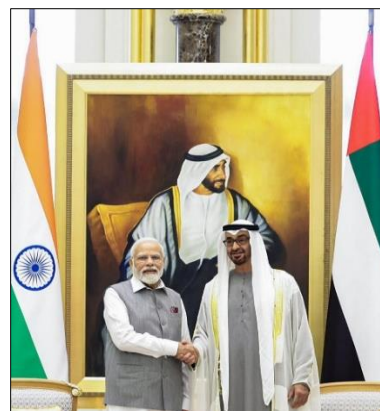
Hon. PM Narendra Modi meets UAE President and Ruler of Abu Dhabi Sheikh Mohamed-bin-Zayed-Al-Nahyan at the iconic Qasr-Al-Watan Presidential Palace in Abu Dhabi, UAE.

In his remarks after meeting the UAE President, PM Modi said India-UAE trade witnessed a 20% increase since the signing of the Comprehensive Economic Partnership Agreement in 2022. He said the agreement signed for trade settlement in the currencies of the two countries shows the strong economic cooperation and mutual trust between the two nations. The leaders expressed satisfaction that UAE-India relations have witnessed tremendous progress on all fronts. India-UAE trade rose to USD 85 billion in 2022, making the UAE India’s