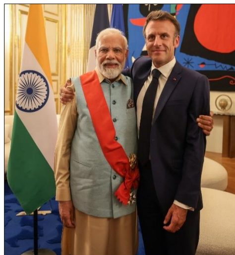
Hon. PM Modi conferred with the Grand Cross of the Legion of Honour by President Emmanuel Macron.

During the visit, Hon. PM Modi announced that India and France have agreed to use Unified Payments Interface (UPI), opening a huge new market for Indian innovation. Addressing the Indian community at the La Seine Musicale, a performing arts centre on an island in River Seine, Modi said very soon Indian tourists will be able to make rupee payments using UPI from atop the Eiffel Tower. “In France, an agreement has been made for the use of India's UPI... It will be started from the Eiffel Tower, and now Indian tourists would be able to make payments in rupees, through UPI, from the Eiffel Tower,” the Prime Minister said.