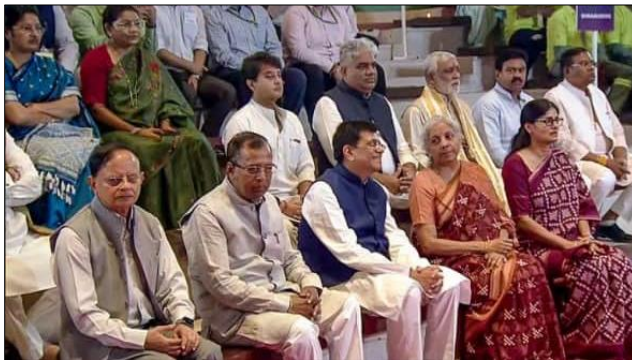
Hon. Union Ministers Piyush Goyal, Nirmala Sitharaman, Jyotiraditya Scindia, Sh. Som Parkash, Hon'ble MoS for Commerce & Industry, and other dignitaries attend the puja at the new ITPO complex prior to the inauguration of the International Exhibition-cum-Convention Centre (IECC) complex, in New Delhi.

The International Exhibition-cum-Convention Centre (IECC) - Bharat Mandapam - part of the 123-acre India Trade Promotion Organisation (ITPO) complex was inaugurated by Hon. Prime Minister Narendra Modi on July 26, 2023. The inaugural ceremony was attended by around 3,000 guests including Cabinet ministers, captains of industry, film personalities and others.