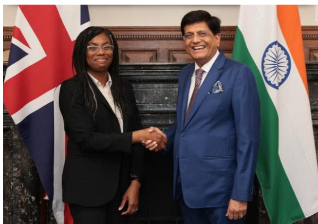
Hon. Piyush Goyal, Union Commerce & Industry Minister with Ms. Kemi Badenoch, Business and Trade Secretary, in London.

“Discussed how both sides can add further momentum to the India-UK Free Trade Agreement negotiations for a mutually beneficial deal,” Hon. CIM said on Twitter. This round of talks between the two sides concluded on July 14 th . Ms Badenoch described the potential agreement as “a deal to benefit businesses across both nations and strengthen our deep and historic ties.”