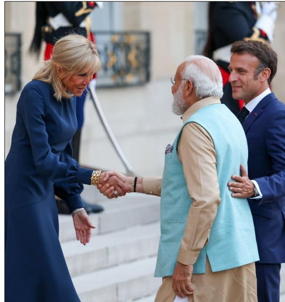
Hon. PM Narendra Modi warmly received by French President Emmanuel Macron and his wife Brigitte Marie-Claude Macron for a private dinner at the Élysée Palace.