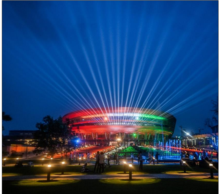
Hon. PM Narendra Modi inaugurated the new International Exhibition-cum-Convention Centre (IECC) named as 'Bharat Mandapam,' at the redeveloped Pragati Maidan complex in Delhi. The revamped complex is India's largest MICE destination and boasts state-of-the-art facilities including a convention centre, exhibition halls, and amphitheatres.